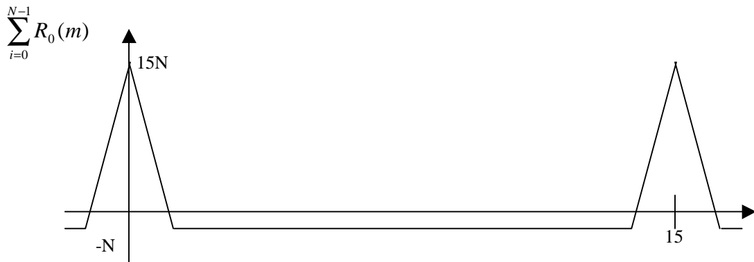
(a) Auto correlation property \sum_{i=0}^{N-1} R_0(m) of the combined frame synchronization words