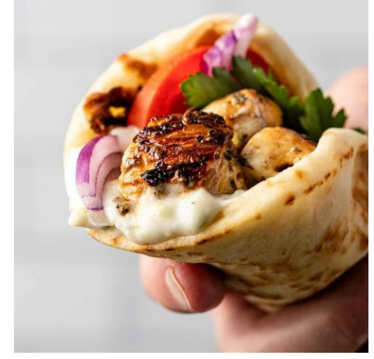
Its called "Sou-vla-ki"