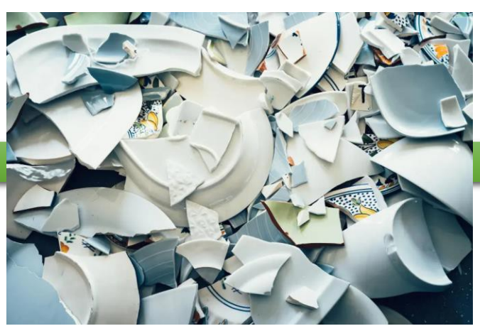
Smashing plates is not as traditional as people might think