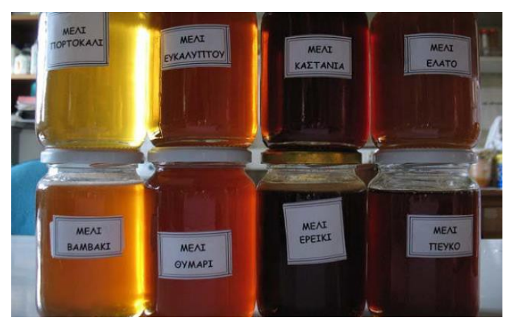
Loads of honey varieties...

Hello: Ya-soo Goodbye: Ya-soo Cheers: Ya-mass