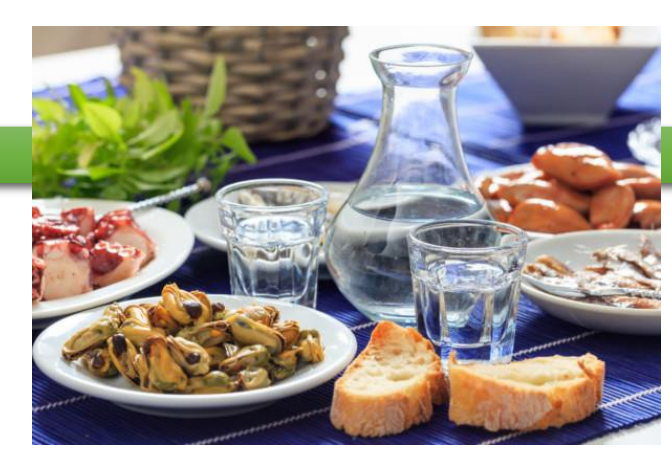
This is how you drink ouzo or tsipouro