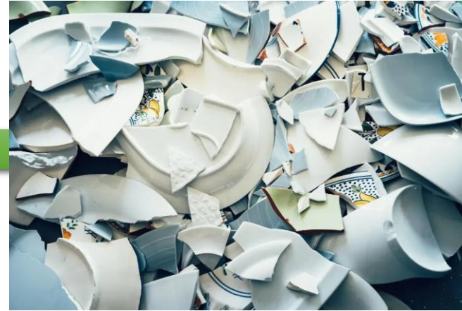
Smashing plates is not as traditional as people might think