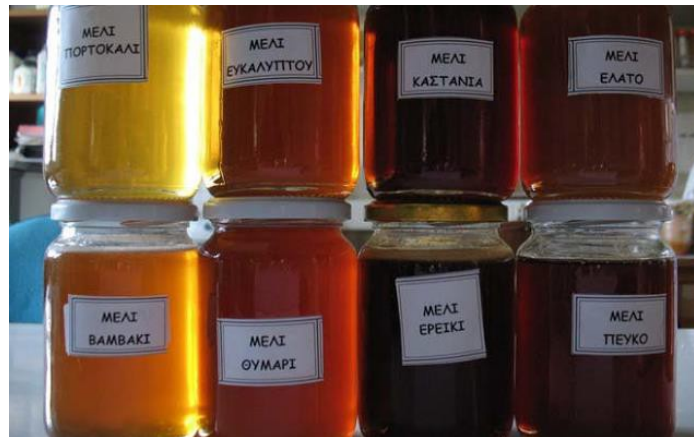
Loads of honey varieties...

Hello: Ya-soo Goodbye: Ya-soo Cheers: Ya-mass Good Morning: Kah-lee-mer-ah