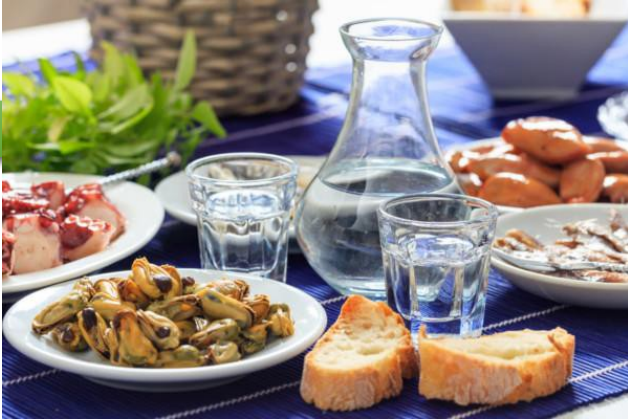
This is how you drink ouzo or tsipouro