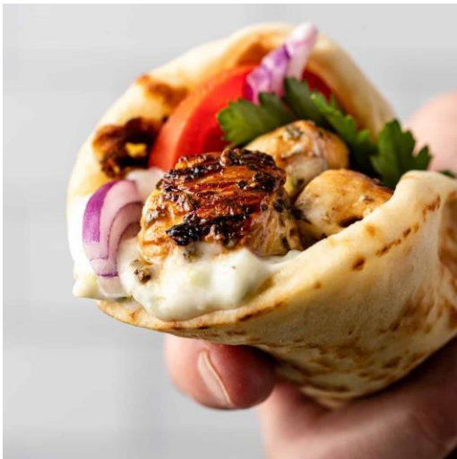
Its called "Sou-vla-ki"