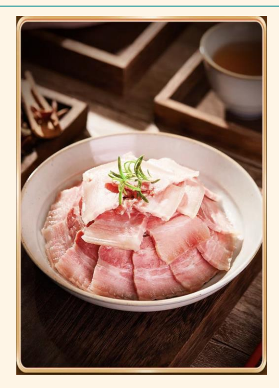
刀板香 (Knife board fragrance)