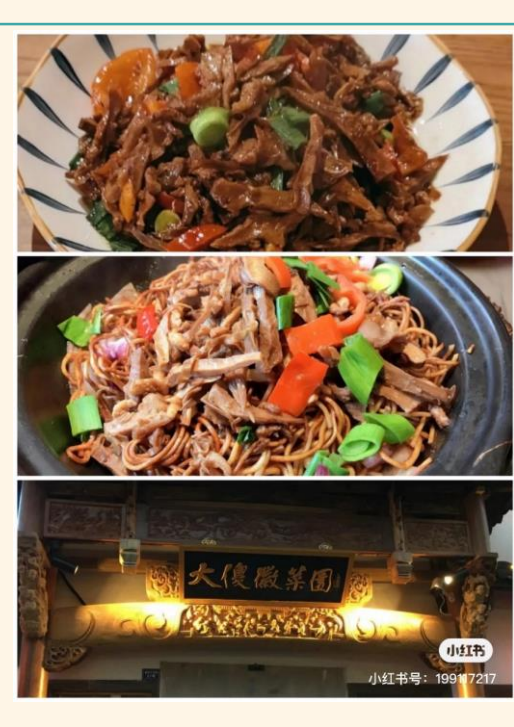
大傻徽菜园 黄山市屯溪区下马路37号 肉圆煲,徽州酱排