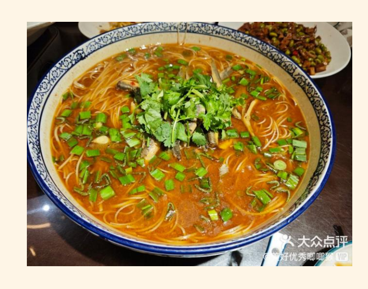
泥鳅挂面 (Loach noodles)