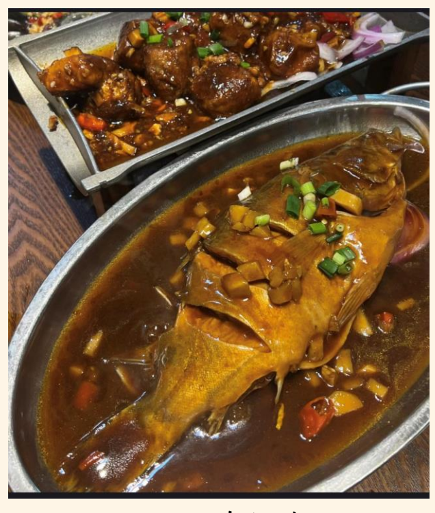
臭鳜鱼 (Stinky Mandarin Fish)