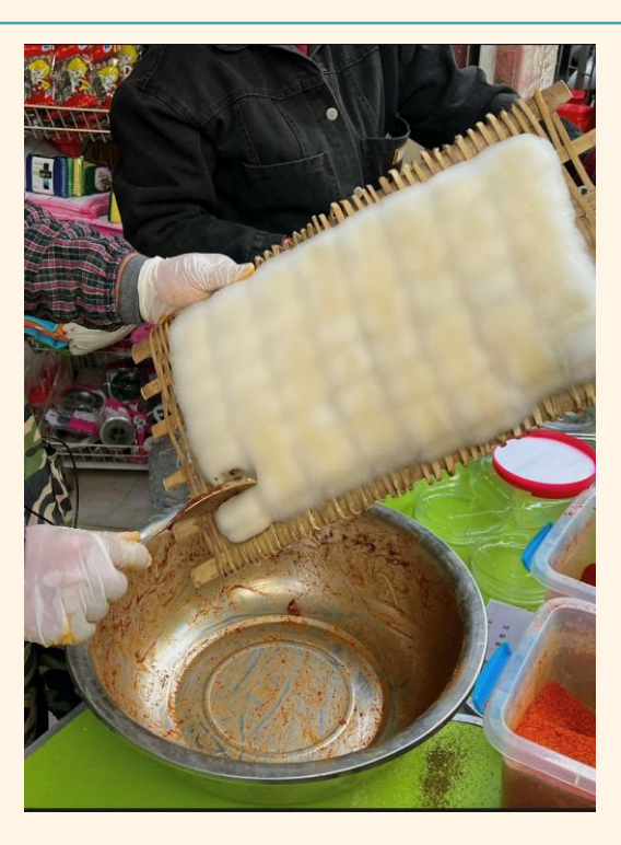
毛豆腐 (Hairy Tofu)