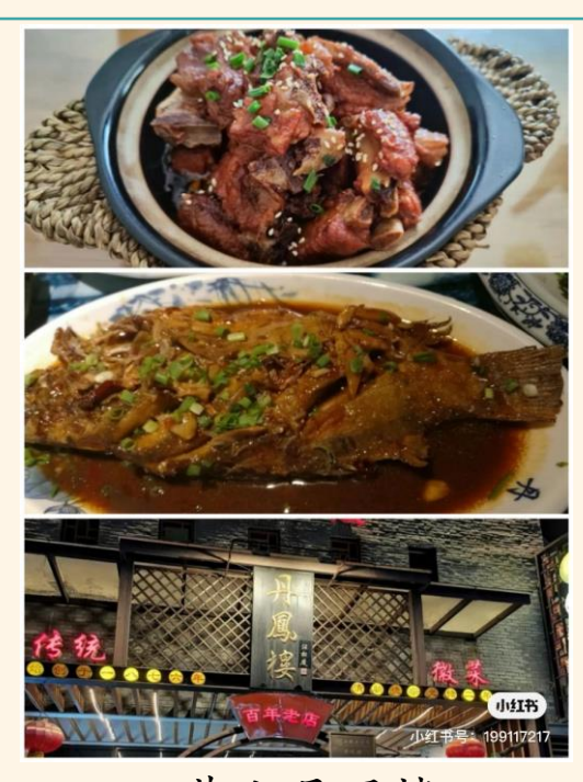
黄山丹凤楼 黄山市屯溪区黎阳in巷美食一条街20号 老妈小炒, 老母鸡汤, 干锅臭鳜鱼