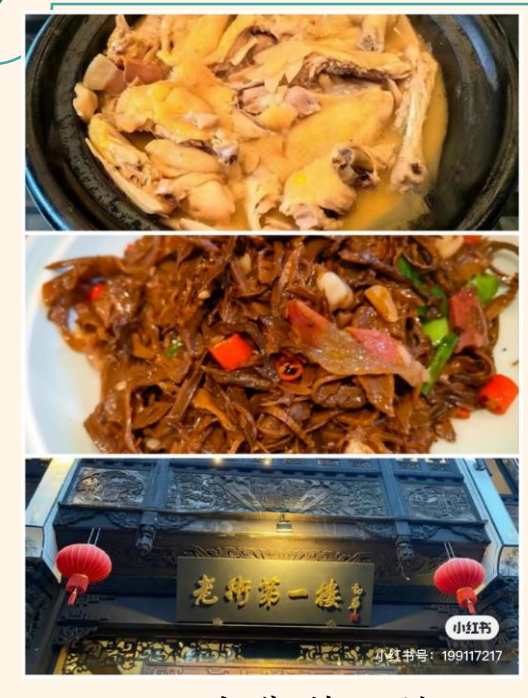
老街第一楼 黄山市屯溪区老街247号(老街口) 红烧臭鳜鱼,一楼如意鸡