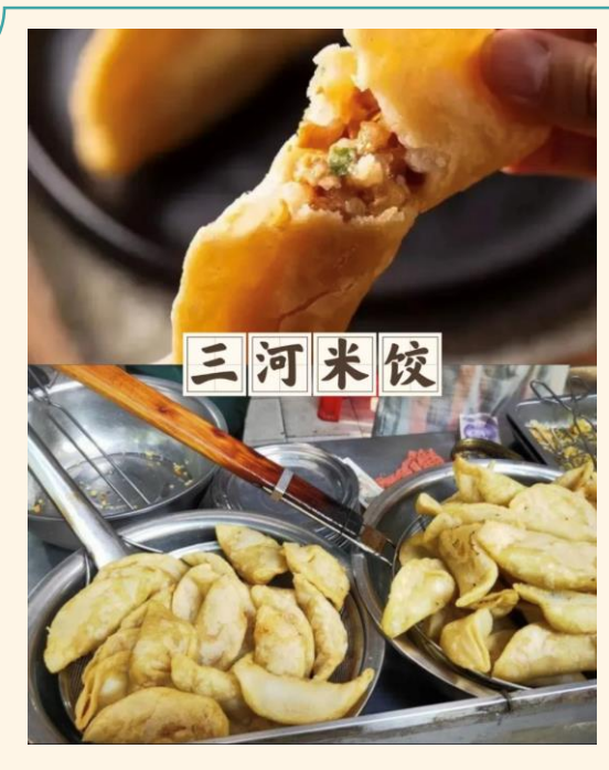
三河米饺 (Sanhe Rice Dumplings)