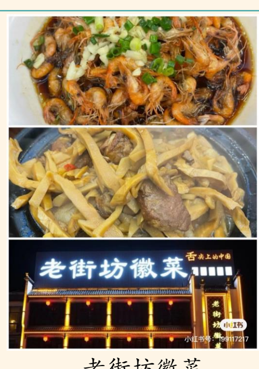
老街坊徽菜 汤川路兆成天地B1幢D号 牛腩锅巴,葱油小河虾