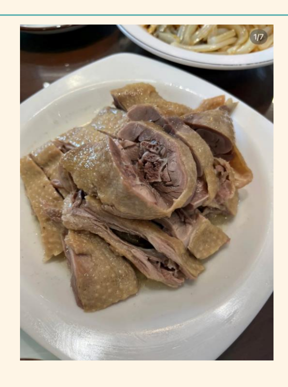
吴山贡鹅 (Wushan Tribute Goose)