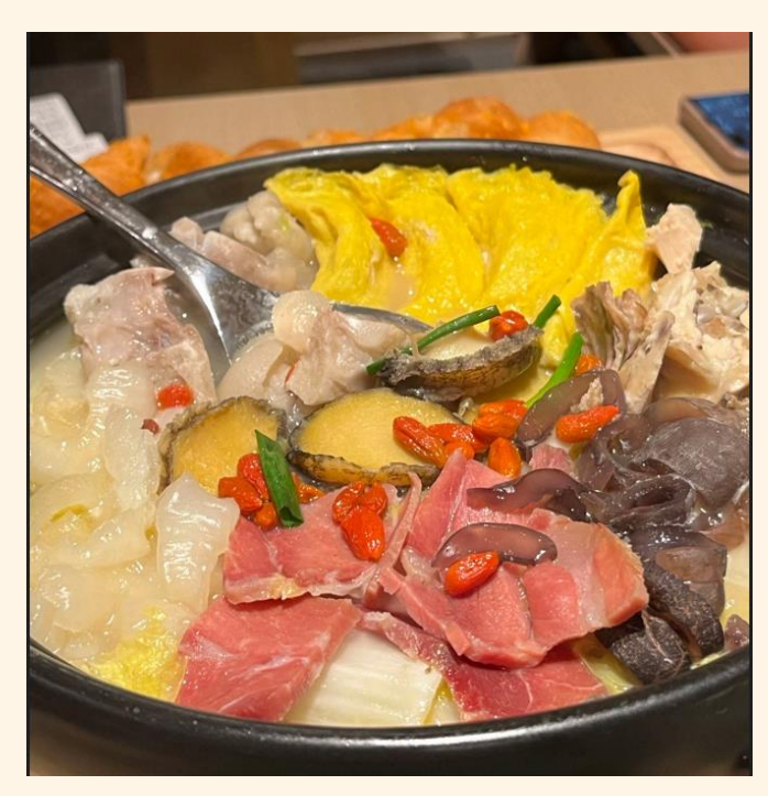
李鸿章大杂烩 (Li Hongzhang's hodgepodge)