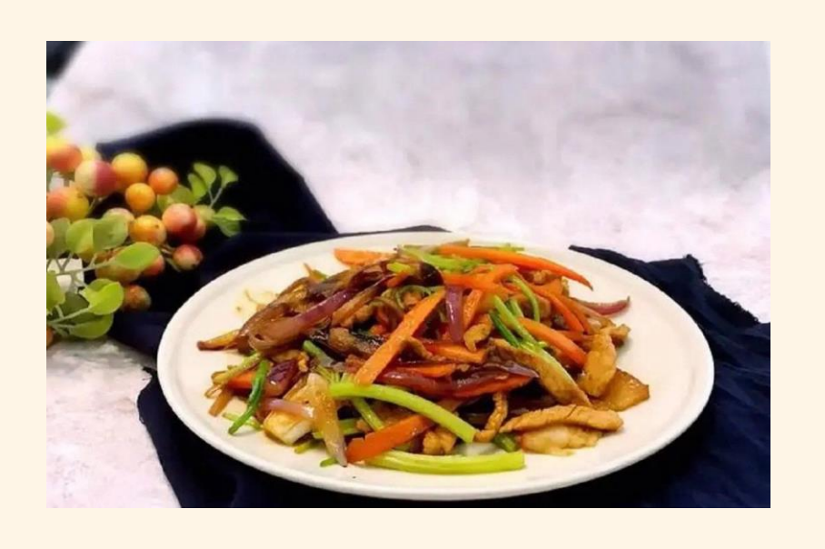
三河小炒 (Sanhe stir-fry)