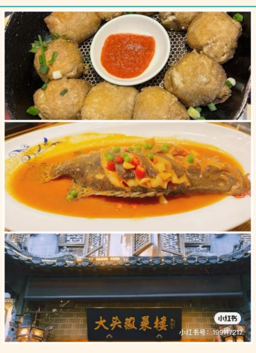
大头徽菜楼 黄山市屯溪区滨江中路19-29号 黄山市屯溪区仙人洞北路14号 毛豆腐, 酱排骨