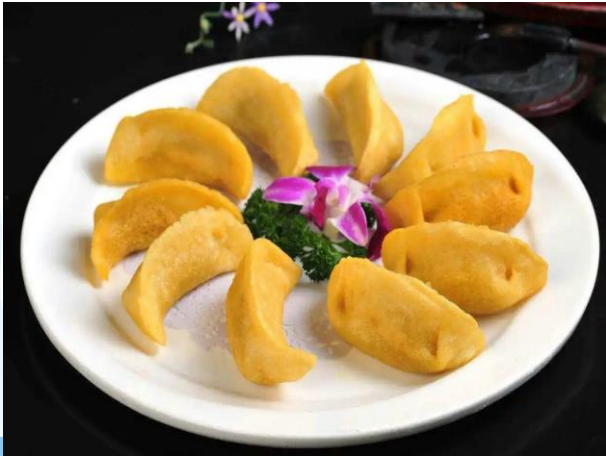
Three Rivers Rice Dumplings (三河米饺)