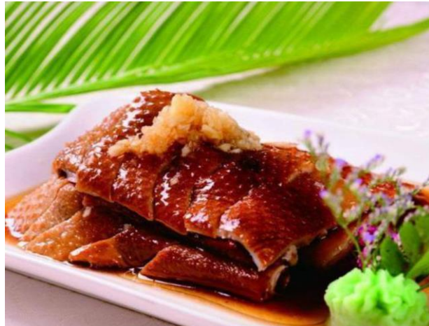
Luzhou roast duck (庐州烤鸭)