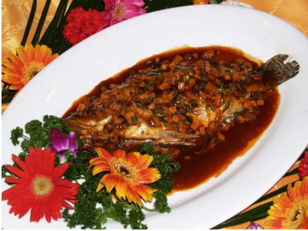
Preserved mandarin fish (臭鳜鱼)