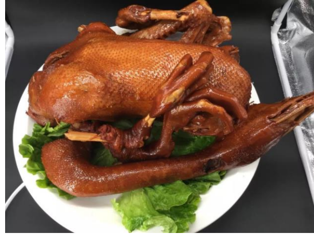
Wu Shan Gong Goose (吴山贡鹅)