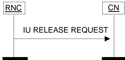
Figure 3: Iu Release Request procedure. Successful operation.

The RNS controlling the Iu connection(s) of that particular UE shall initiate the procedure by generating an IU RELEASE REQUEST message towards the affected CN domain(s). The procedure may be initiated for instance when the contact with a particular UE is lost or due to user inactivity.